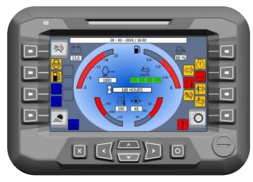
Optional color screen