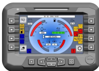
Optional color screen