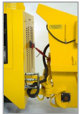
2 rear connectors