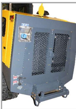
2 rear connectors