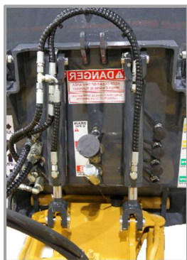
Up to 8 front connectors

Several modifications to the vehicle significantly reduce noise levels and vibrations in the cabin. Additionally, the new driving configuration allows the operator to be centered and rest their forearms on the armrests during operations, thus reducing fatigue. Finally, the workspace is now more open and spacious.